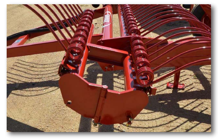
Savage's folding rakes make storage and transportation much easier.

Well managed, clean orchards are better at fending off insects and other pests and make your other orchard tasks that much easier. A Savage rake may be just what is needed to help you get there. With two sizes to choose from, one is certain to be well suited to your needs. Our rakes allow you to adjust tine height and the angle of pitch with controls at the tractor seat.